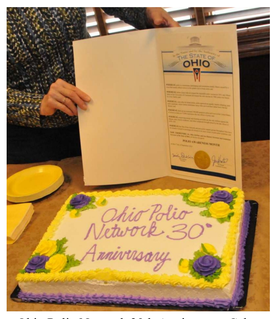
Ohio Polio Network 30th Anniversary Cake